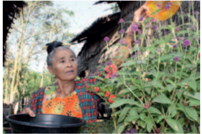
Growing flowers for sale in Myanmar.

Training of caregivers and health professionals is essential to ensure that those who work with older persons have access to information and basic training in the care of older people. Better support must be provided to all caregivers, including family members, community-based carers, particularly for long-term care for frail older persons, and older people who care for others.